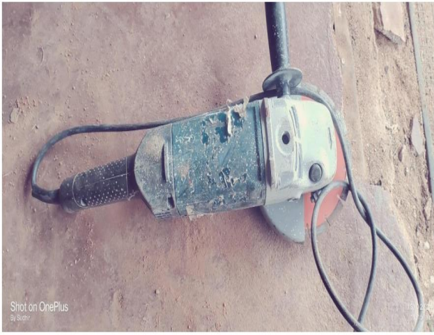
Shot on OnePlus By Sudhir