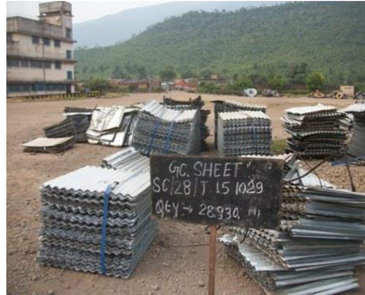
SC28J15 1029-Rej & Scrap GC SHEET- 28.930 M.T