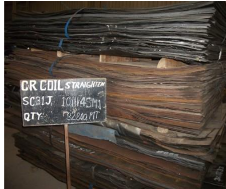
SC31J101114SM1-Rej & Scrap CR COIL STRAIGHTENED-32.800 M.T