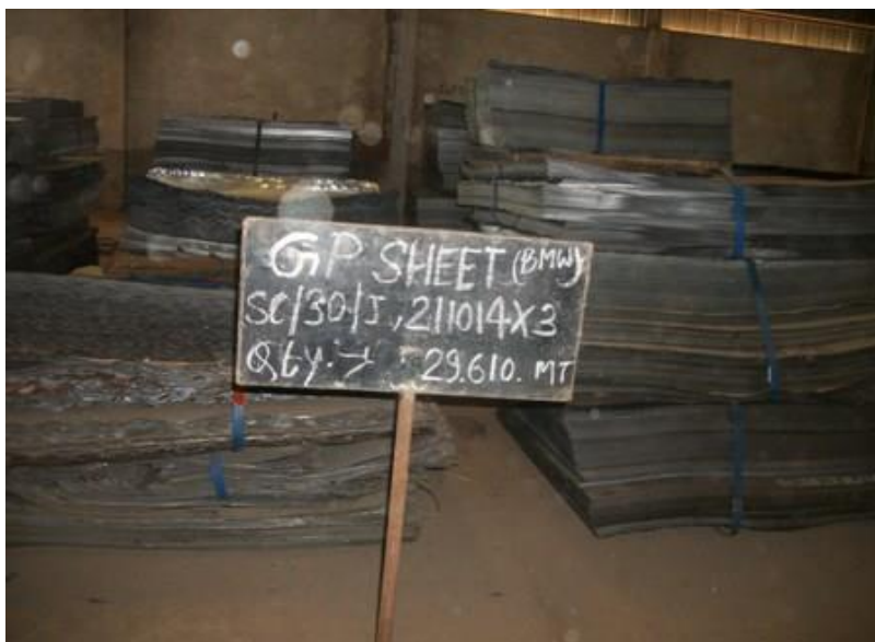
SC30J211014X3-Rej & Scrap GP SHEET BMW-29.610 M.T