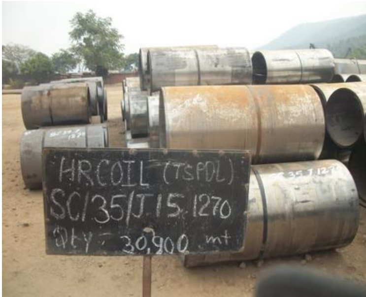
SC35J15 1270-Rej & Scrap HR COIL TSPDL -30.900 M.T