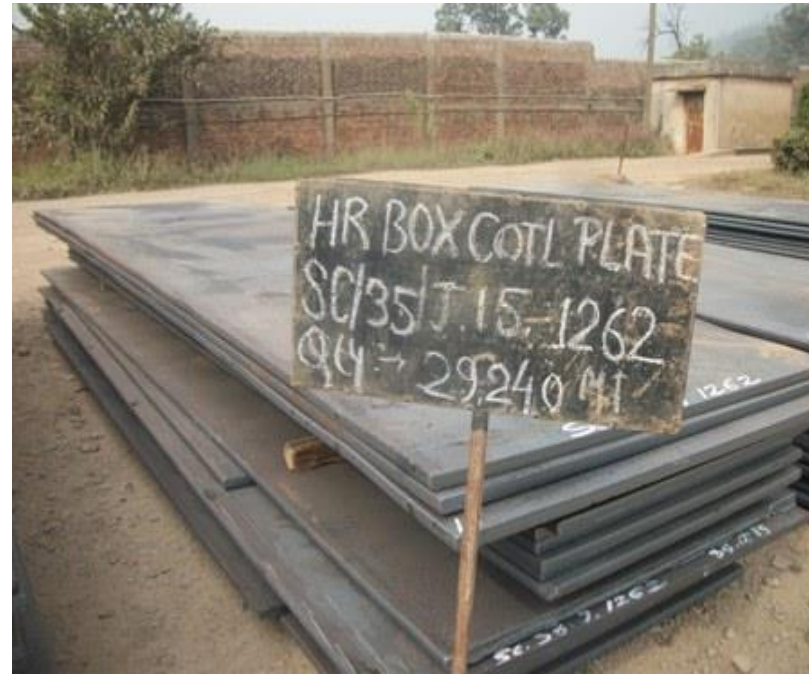
SC35J15 1262-Rej & Scrap HR BOX COIL PLATE -29.240 M.T