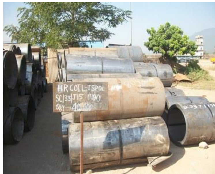
SC33J15 1190-Rej & Scrap HR COIL TSPDL-40.100 M.T