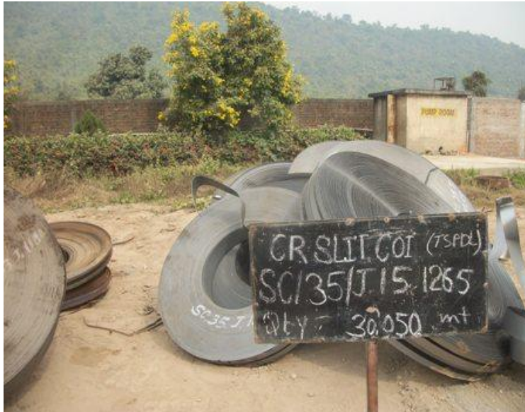
SC35J15 1265-Rej & Scrap CR SLIT COIL TSPDL -30.050 M.T