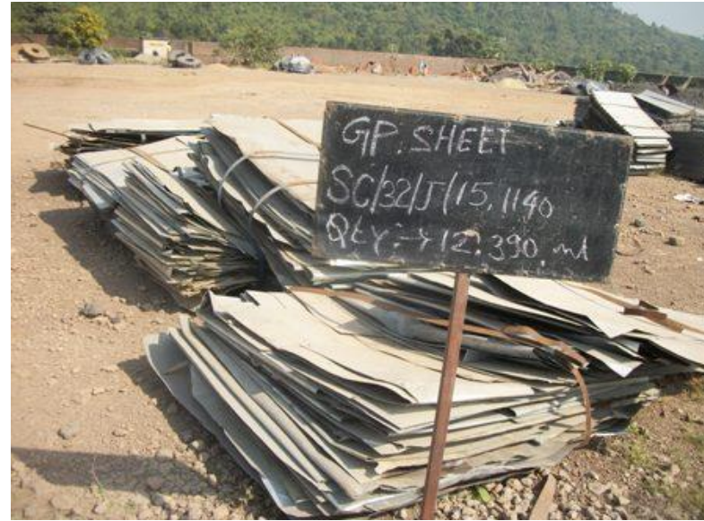
SC32J15 1140-Rej & Scrap GP SHEET-12.390 M.T