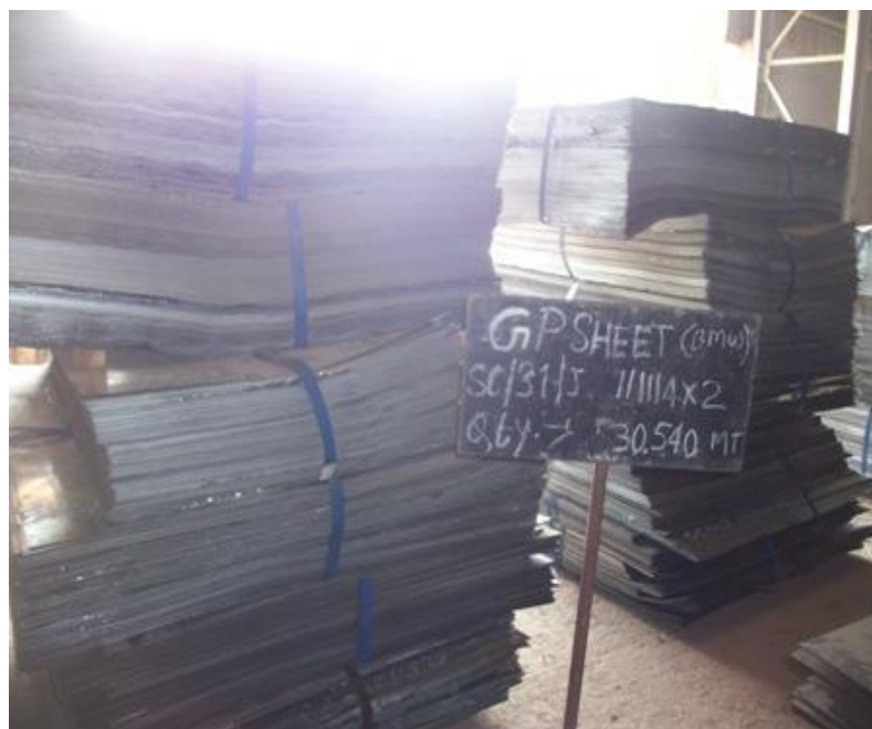
SC31J111114X2-Rej & Scrap GP SHEET BMW-30.540 M.T