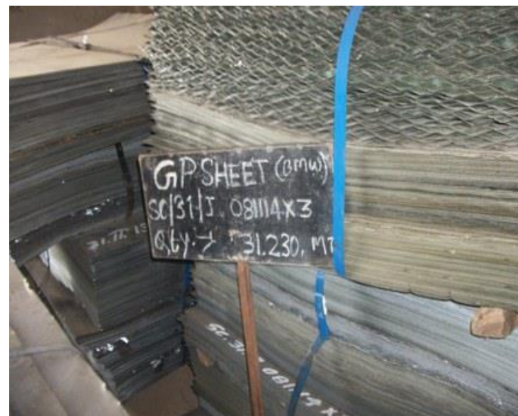
SC31J081114X3-Rej & Scrap GP SHEET BMW-31.230 M.T