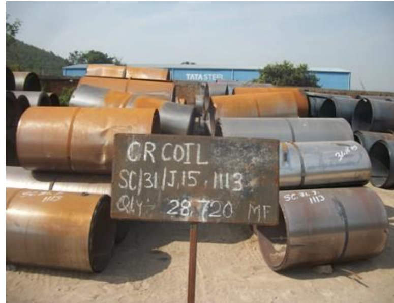
SC31J15 1113-Rej & Scrap CR COIL-28.720 M.T