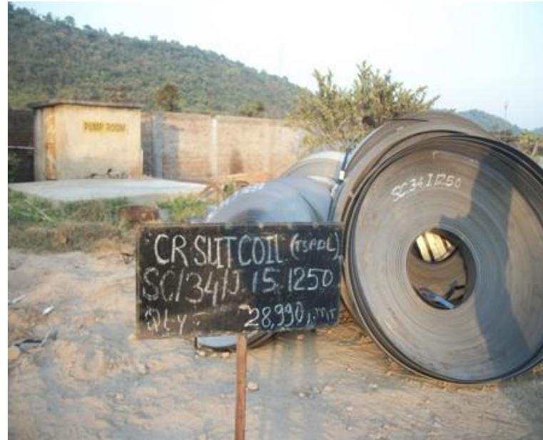
SC34J15 1250-Rej & Scrap CR SLIT COIL TSPDL -28.990 M.T