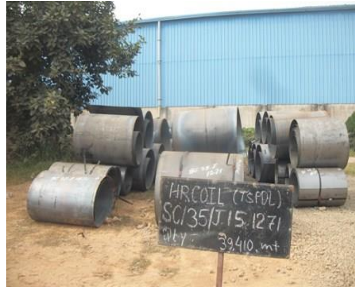
SC35J15 1271-Rej & Scrap HR COIL TSPDL -39.410 M.T