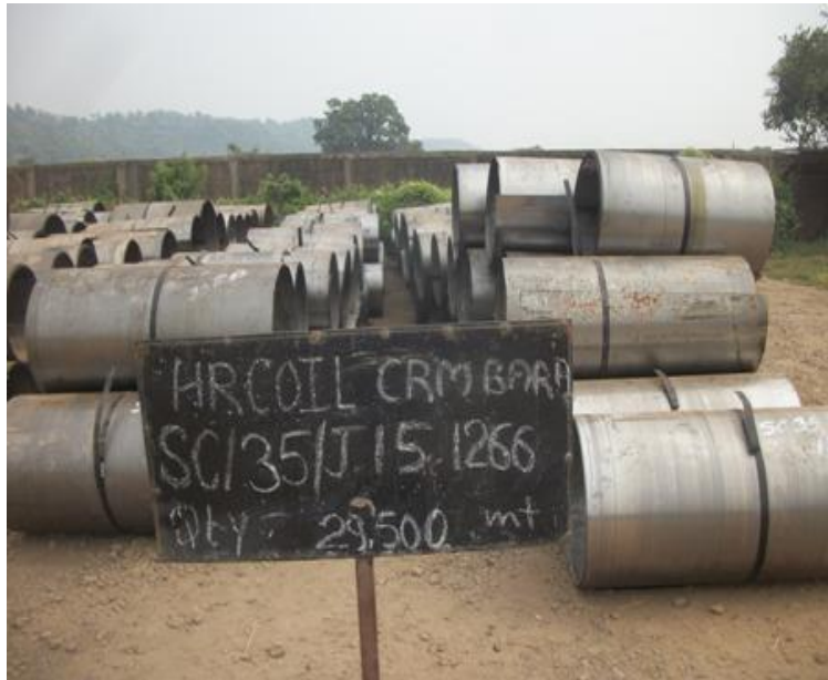
SC35J15 1266-Rej & Scrap HR COIL CRM BARR(IN MIX CONDITION) -29.500 M.T