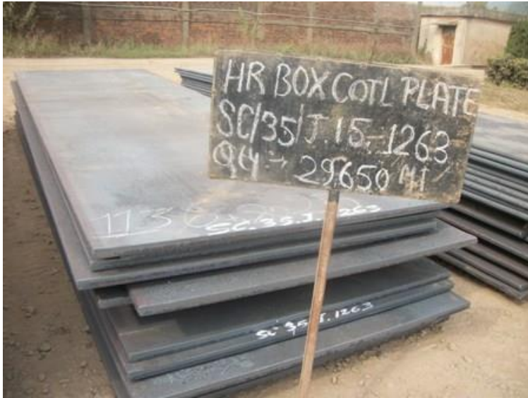
SC35J15 1263-Rej & Scrap HR BOX COIL PLATE -29.650 M.T