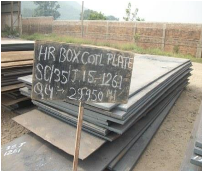
SC35J15 1261-Rej & Scrap HR BOX COIL PLATE -29.950 M.T