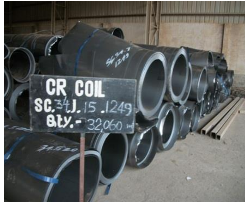
SC34J15 1249-Rej & Scrap CR COIL -32.060 M.T