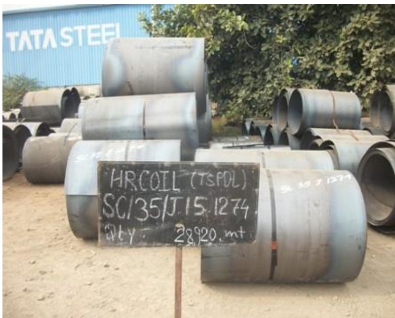
SC35J15 1274-Rej & Scrap HR COIL TSPDL -28.920 M.T