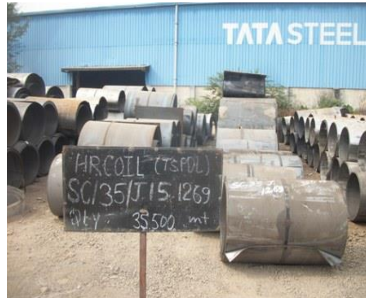
SC35J15 1269-Rej & Scrap HR COIL TSPDL -35.500 M.T