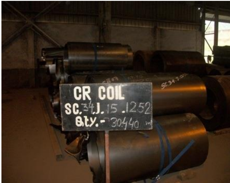
SC34J15 1252-Rej & Scrap CR COIL -30.440 M.T