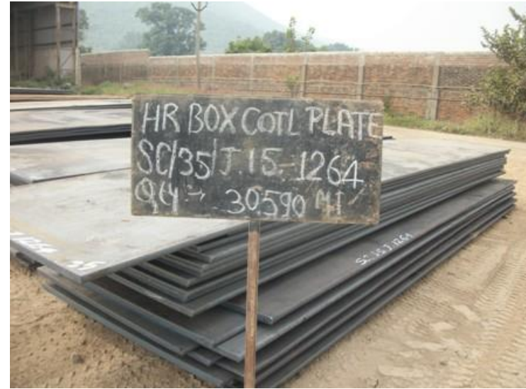
SC35J15 1264-Rej & Scrap HR BOX COIL PLATE -30.590 M.T