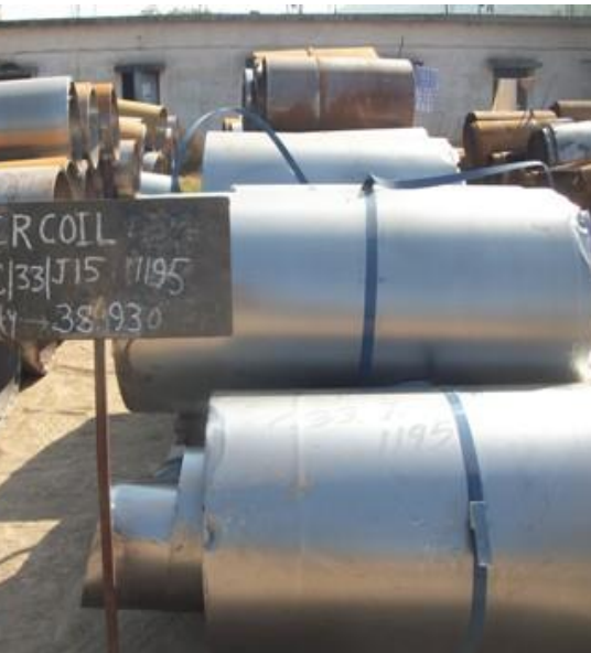
SC33J15 1195-Rej & Scrap CR COIL-38.930 M.T