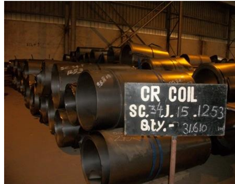
SC34J15 1253-Rej & Scrap CR COIL -31.610 M.T