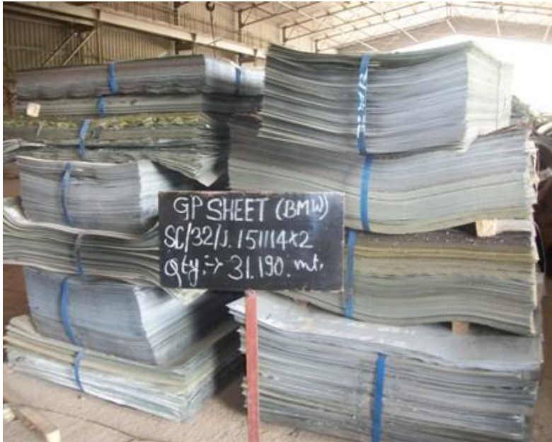
SC32J15114X2-Rej & Scrap GP SHEET BMW-31.190 M.T