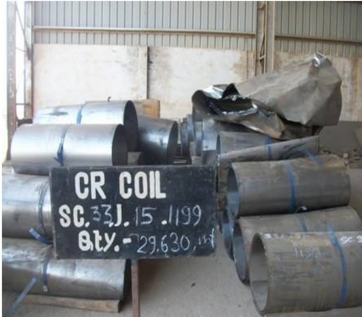
SC33J15 1199-Rej & Scrap CR COIL-29.630 M.T