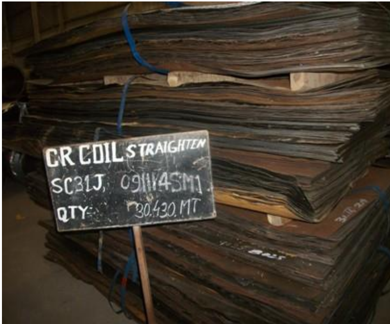
SC31J091114SM1-Rej & Scrap CR COIL STRAIGHTENED-30.430 M.T