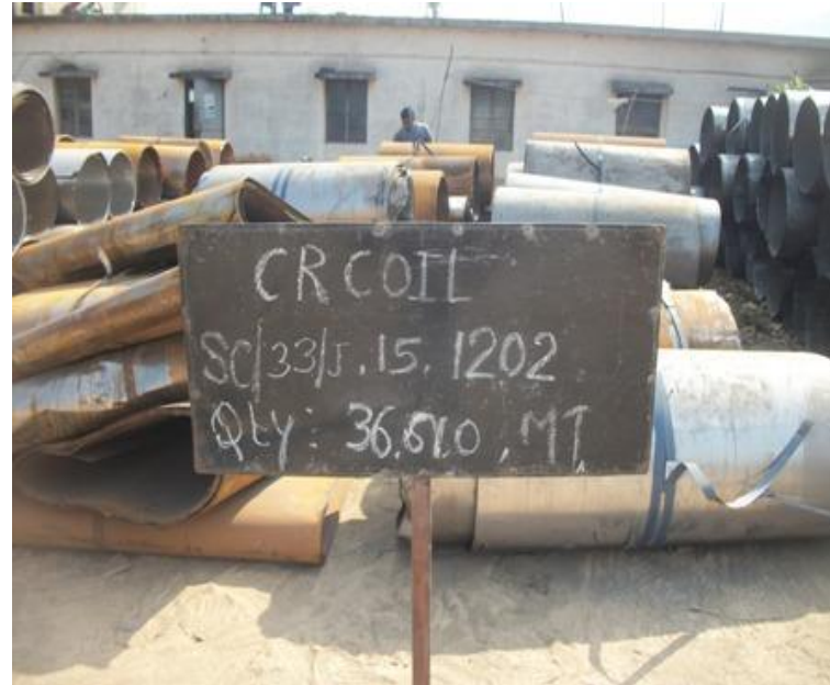
SC33J15 1202-Rej & Scrap CR COIL-36.610 M.T