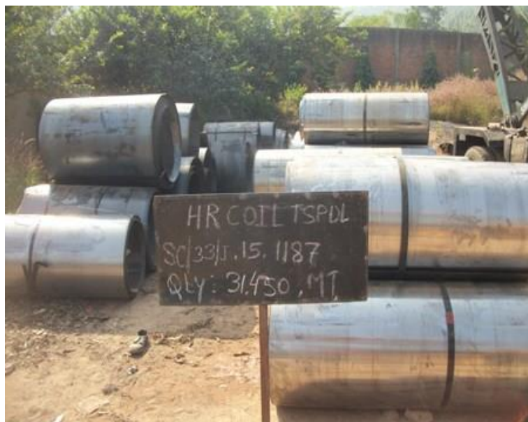
SC33J15 1187-Rej & Scrap HR COIL TSPDL-31.450 M.T