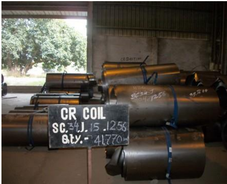
SC34J15 1256-Rej & Scrap CR COIL -41.770 M.T