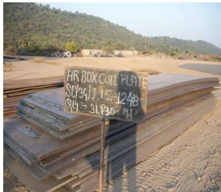
SC34J15 1248-Rej & Scrap HR BOX COIL PLATE -31.130 M.T