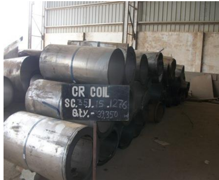
SC35J15 1276-Rej & Scrap CR COIL -39.350 M.T