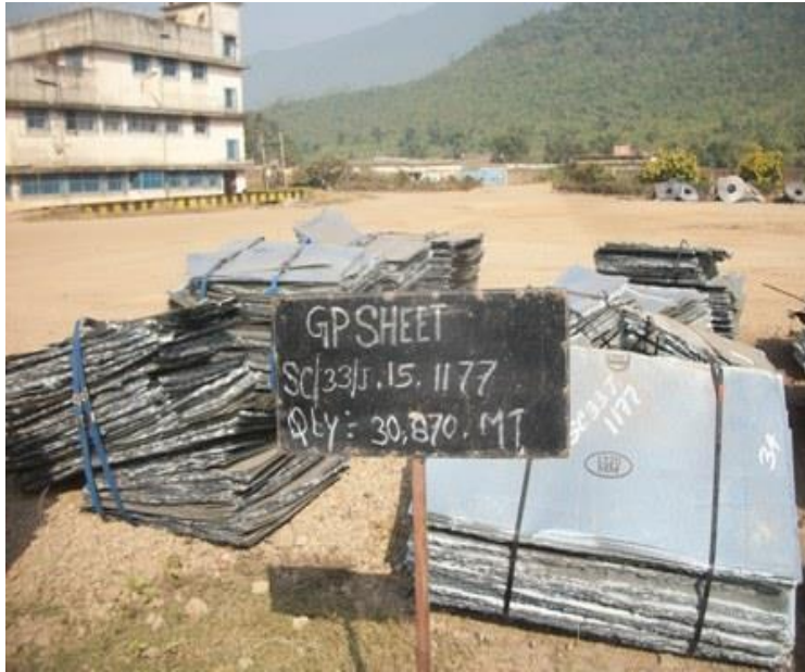
SC33J15 1177-Rej & Scrap GP SHEET-30.870 M.T