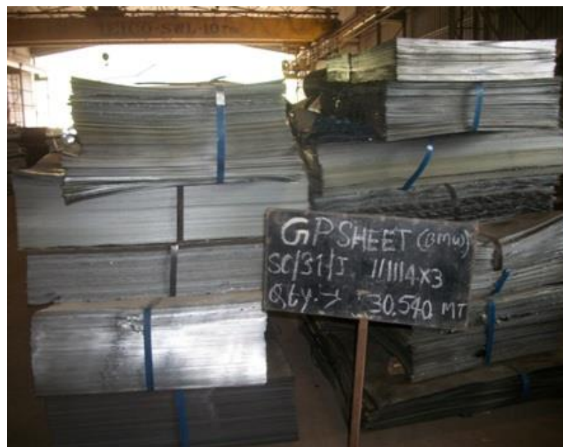
SC31J111114X3-Rej & Scrap GP SHEET BMW-30.540 M.T