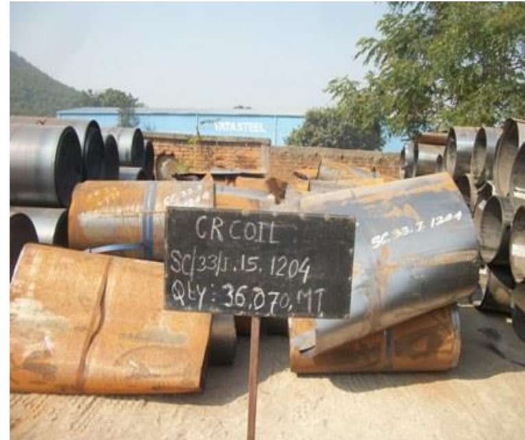
SC33J15 1204-Rej & Scrap CR COIL-36.070 M.T