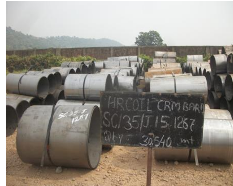
SC35J15 1267-Rej & Scrap HR COIL CRM BARR(IN MIX CONDITION) -30.540 M.T