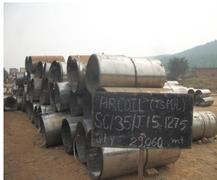
SC35J15 1275-Rej & Scrap HR COIL TSPDL -29.060 M.T