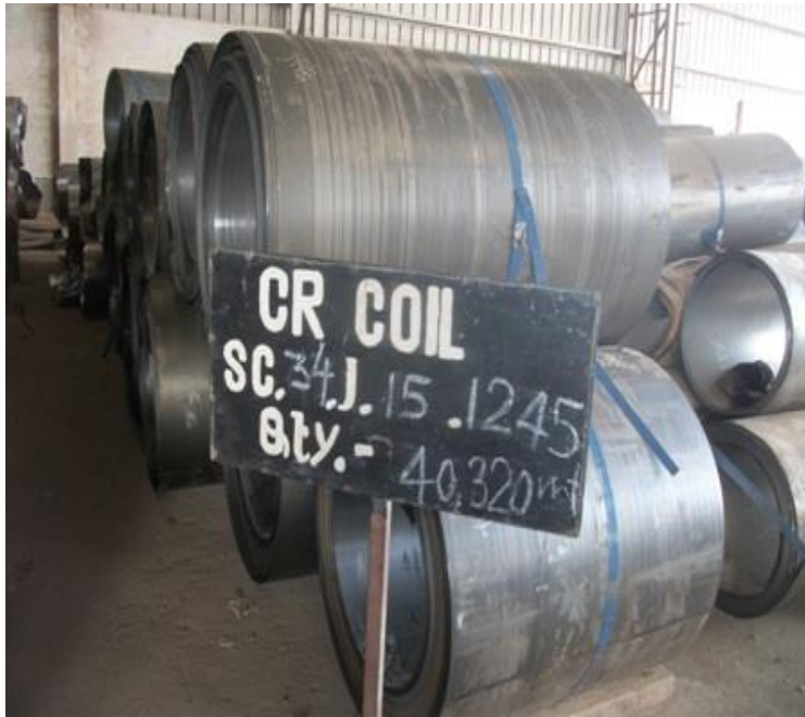
SC34J15 1245-Rej & Scrap CR COIL -40.320 M.T