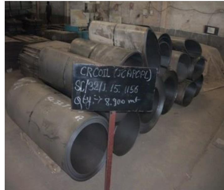
SC32J15 1156-Rej & Scrap CR COIL-300 KG(JCAPCPL)-8.900 M.T