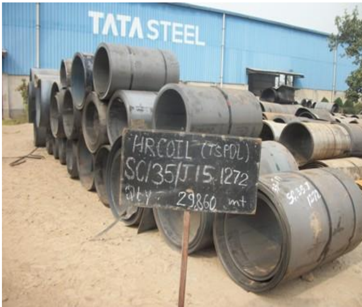
SC35J15 1272-Rej & Scrap HR COIL TSPDL -29.860 M.T