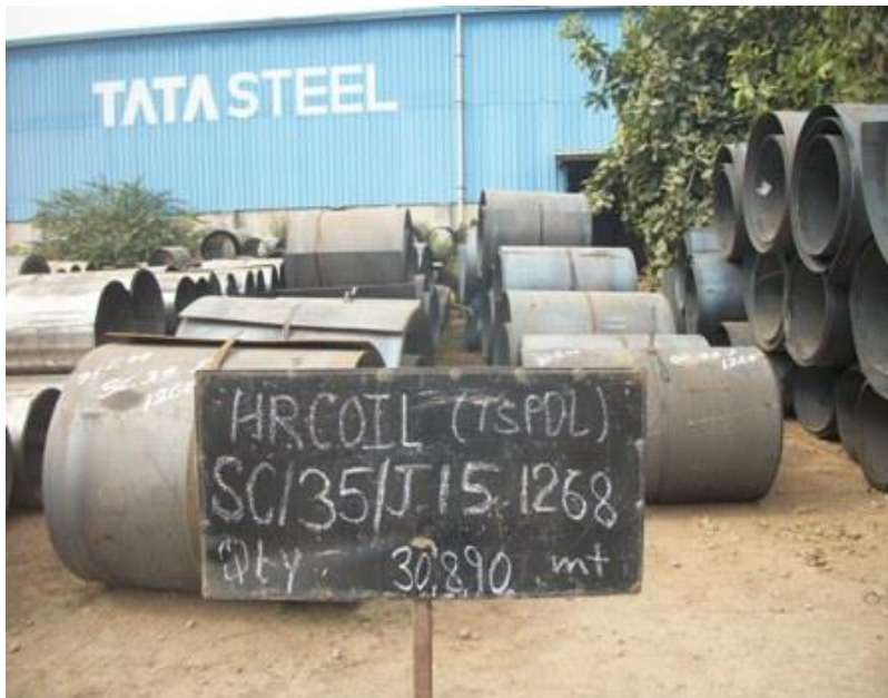
SC35J15 1268-Rej & Scrap HR COIL TSPDL -30.890 M.T