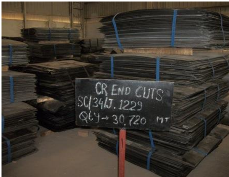
SC34J15 1129-Rej & Scrap CR END CUTS -30.720 M.T