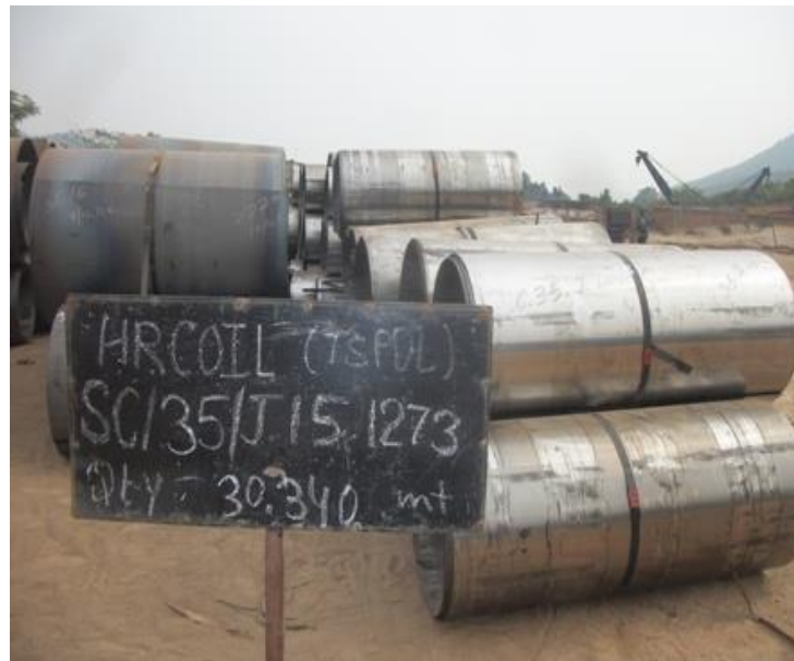
SC35J15 1273-Rej & Scrap HR COIL TSPDL -30.340 M.T