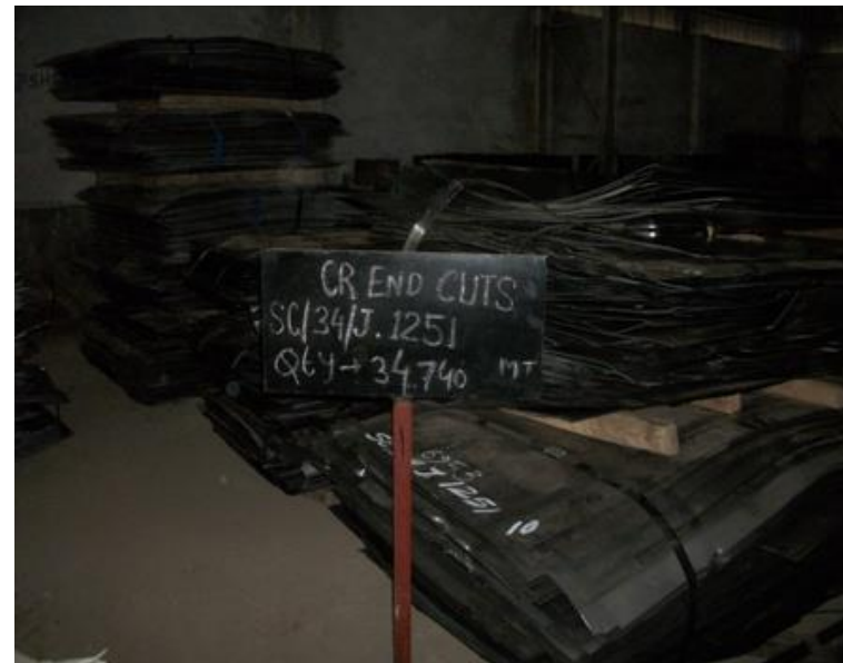
SC34J15 1251-Rej & Scrap CR END CUTS -34.740 M.T