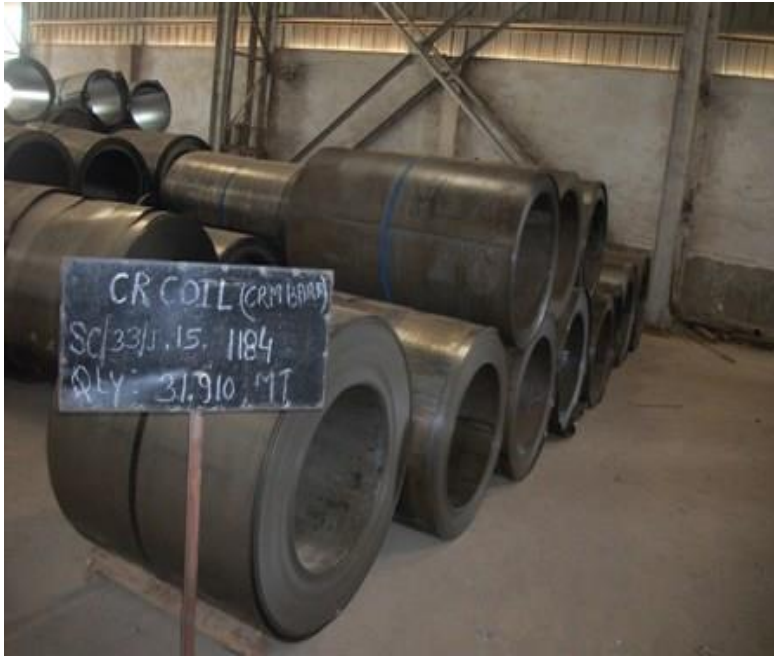
SC33J15 1184-Rej & Scrap CR COIL CRM BARA-31.910 M.T