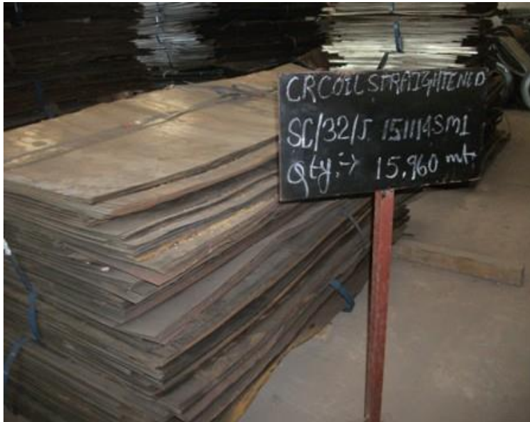
SC32J151114SM1-Rej & Scrap CR COIL STRAIGHTENED-15.960 M.T