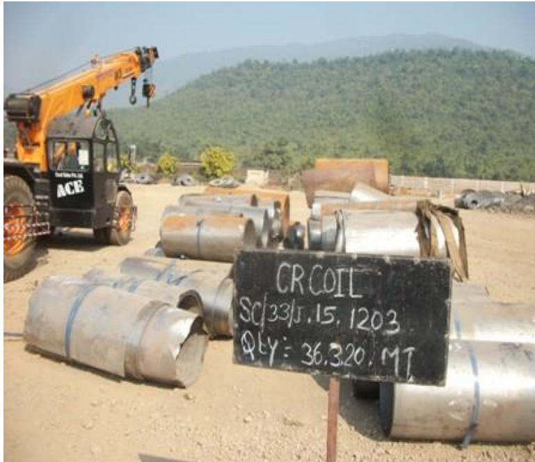
SC33J15 1203-Rej & Scrap CR COIL-36.320 M.T