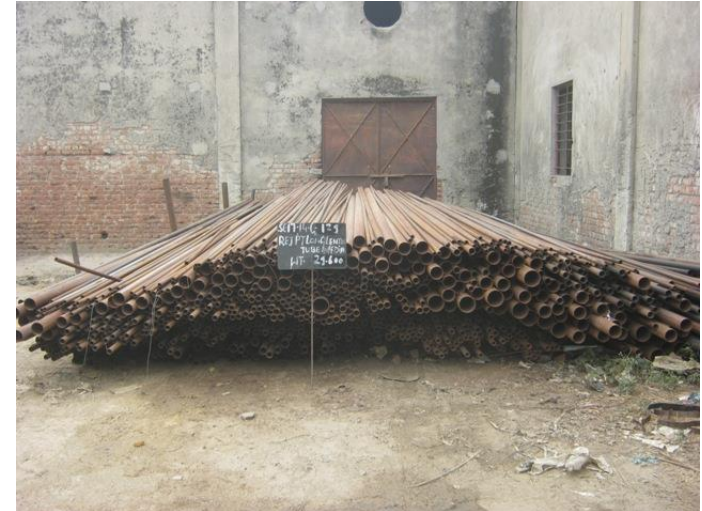
SC-17-14-G-129 Rej P T Long Length tubes diff dia QTY=29.600M.T.