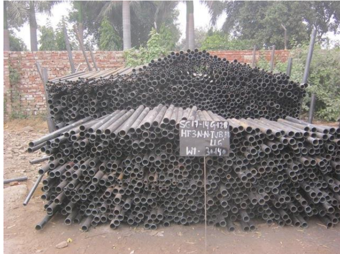
SC-17-14-G-128 HF3-N-N-TUB-BU-LLG-LongLength (Less Than 1.5 Meter) QTY=30.140M.T.