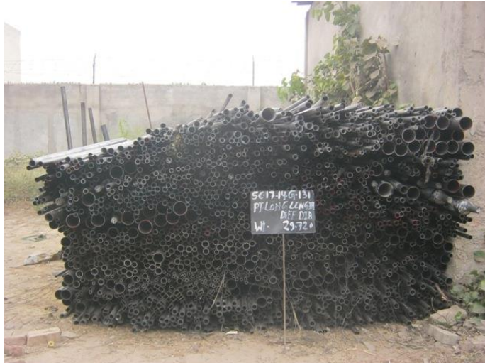
SC-17-14-G-131 Rej P T Long Length tubes diff dia QTY=29.720M.T.