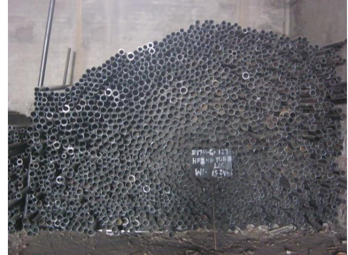
SC-17-14-G-127-HF2-N-N-TUB-BU-LLG-LongLength (Less Than 1.5 Meter)=15.240M.T.