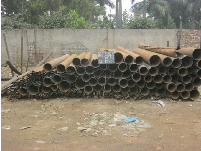
SC-17-14-G-126 BNA-N-O-TUB-BU-LLG-Long Length QTY=12.850M.T.