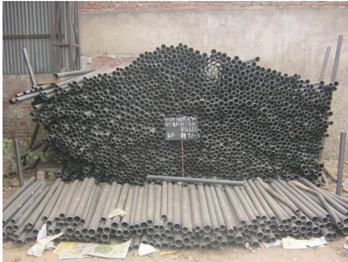
SC-17-14-G-130-HF2-N-N-TUB-BU-LLG-LongLength (Less Than 1.5 Meter) QTY=14.780M.T.