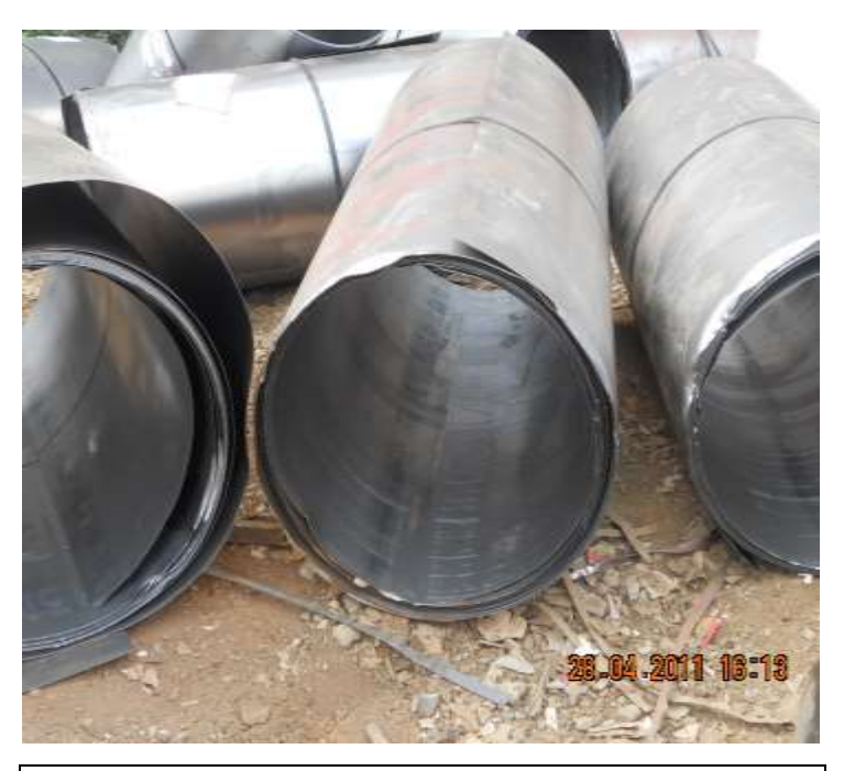
LOT NO. TARP/7

CR COIL ENDS / CUT ENDS (HARD & SOFT MATERIAL) M. NO. 35600 (STOCK + ARISING)