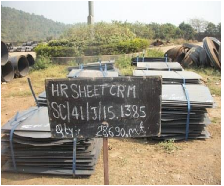
SC41J15 1385-Rej & Scrap HR SHEET CRM -28.690 M.T