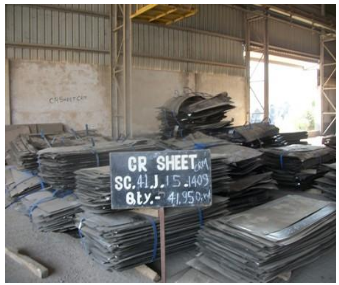
SC41J15 1409-Rej & Scrap CR SHEET CRM -41.950 M.T

SC41J15 1408-Rej & Scrap CR COIL -41.160 M.T