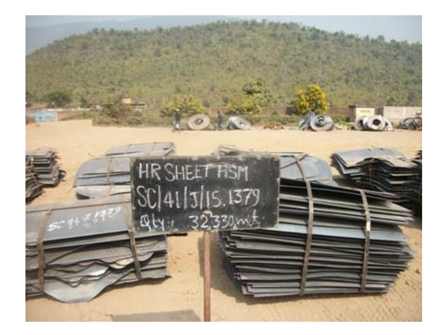
SC41J15 1379-Rej & Scrap HR SHEET HSM -32.330 M.T