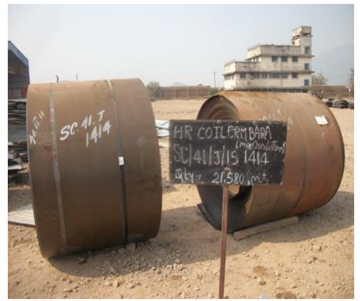
SC41J15 1414-Rej & Scrap HR COIL CRM BARA(IN MIX CONDITION) -21.580 M.T