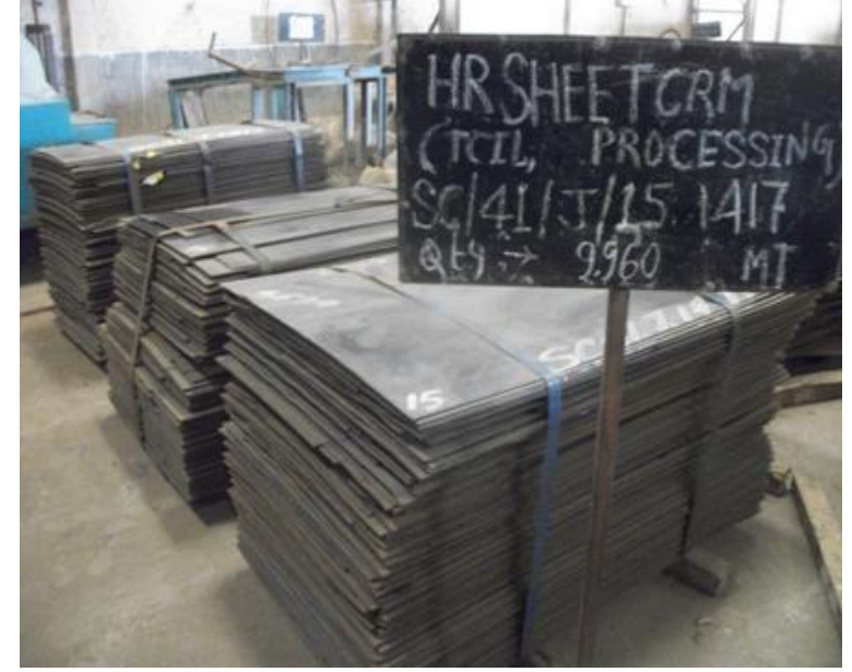
S/41/J/15/1417 -Rej & Scrap HR SHEET CRM(TCIL PROCESSING) - 9.960 M.T

S/41/J/15/1417 -Rej & Scrap HR SHEET CRM(TCIL PROCESSING) -9.960 M.T