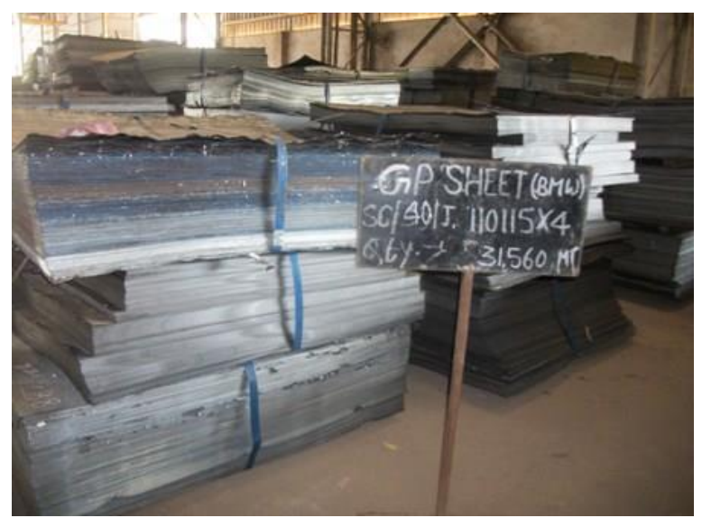
SC40J110115X4-Rej & Scrap GP SHEET BMW -31.560 M.T

SC40J100115X4-Rej & Scrap GP SHEET BMW -31.340 M.T