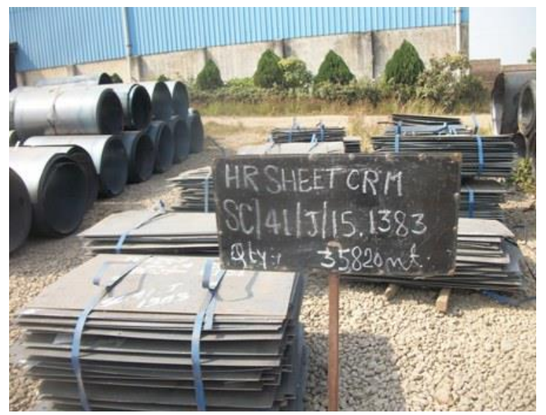
SC41J15 1383-Rej & Scrap HR SHEET CRM -35.820 M.T