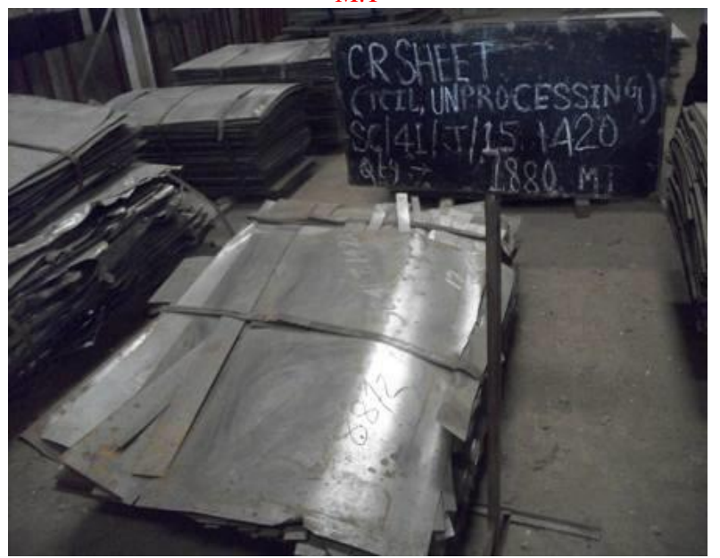
. S/41/J/15/1420 -Rej & Scrap CR SHEET (TCIL UN PROCESSING) -