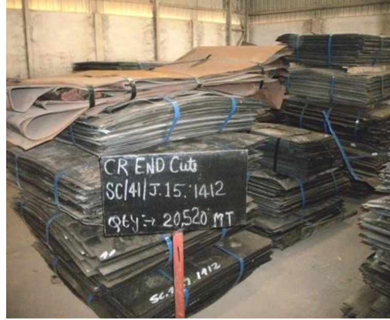
SC41J15 1412-Rej & Scrap CR END CUTS -20.520 M.T

SC41J15 1410-Rej & Scrap CR SHEET CRM -28.500 M.T