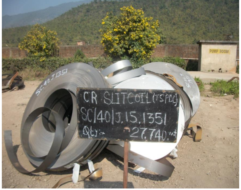
SC40J15 1351-Rej & Scrap CR SLIT COIL TSPDL -27.740 M.T