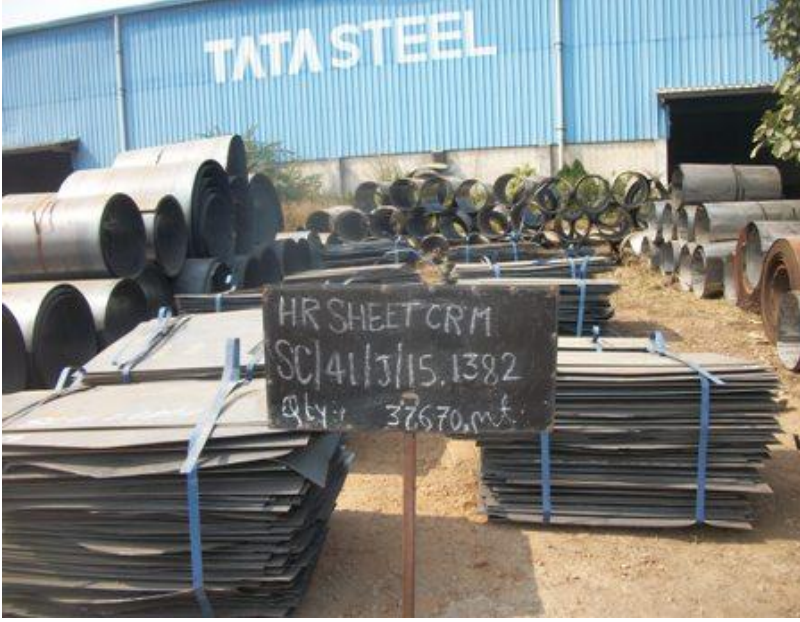
SC41J15 1382-Rej & Scrap HR SHEET CRM -37.670 M.T

SC41J15 1380-Rej & Scrap HR SHEET HSM -27.970 M.T