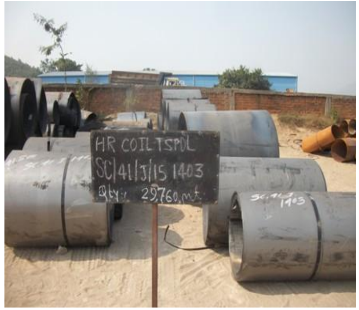
SC41J15 1403-Rej & Scrap HR COIL TSPDL -29.760 M.T