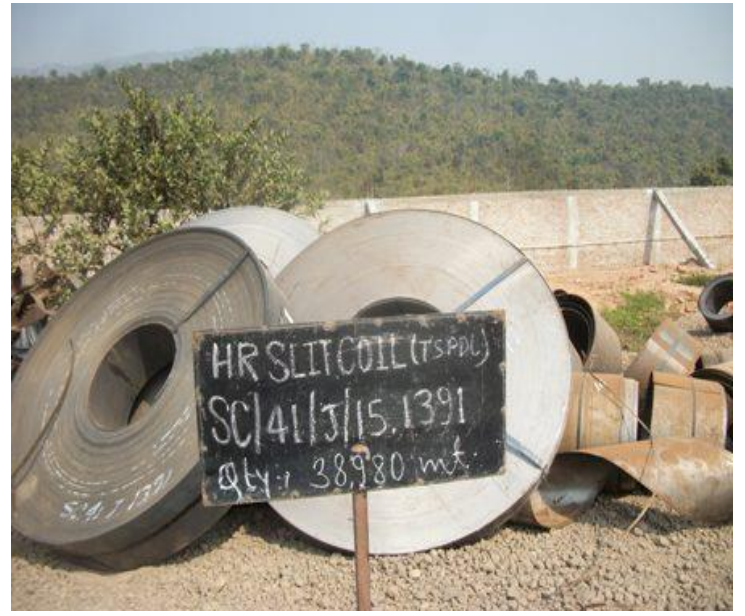
SC41J15 1391-Rej & Scrap HR SLIT COIL TSPDL -38.980 M.T

SC41J15 1389-Rej & Scrap HR BOX COIL PLATE -29.830 M.T