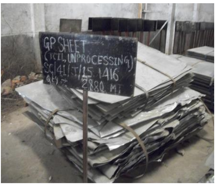
. S/41/J/15/1416 -Rej & Scrap GP SHEET (TCIL UN PROCESSING) -2.880 M.T

. S/41/J/15/1415 -Rej & Scrap GP SHEET (TCIL PROCESSING) -26.990 M.T