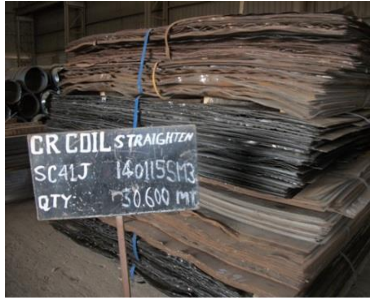
SC41J140115SM3-Rej & Scrap CR COIL STRAIGHTENED -30.600 M.T