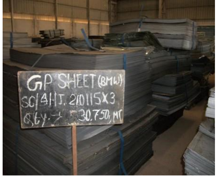
SC41J210115X3-Rej & Scrap GP SHEET BMW -30.750 M.T

SC41J200115X3-Rej & Scrap GP SHEET BMW -31.450 M.T