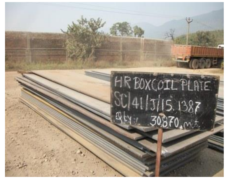
SC41J15 1387-Rej & Scrap HR BOX COIL PLATE -30.870 M.T