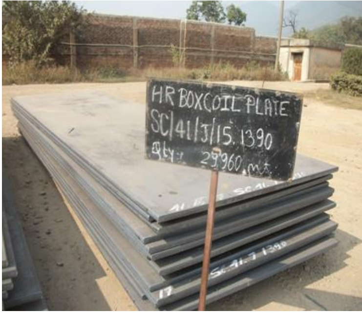
SC41J15 1390-Rej & Scrap HR BOX COIL PLATE -29.960 M.T

SC41J15 1388-Rej & Scrap HR BOX COIL PLATE -35.110 M.T