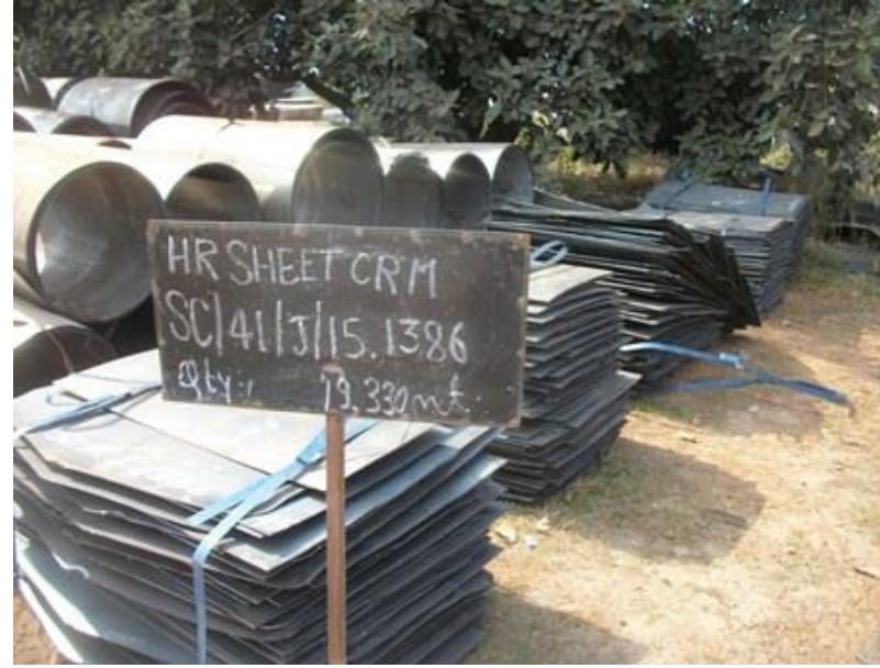
SC41J15 1386-Rej & Scrap HR SHEET CRM -19.330 M.T

SC41J15 1384-Rej & Scrap HR SHEET CRM -35.760 M.T