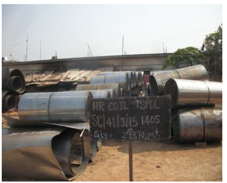
SC41J15 1405-Rej & Scrap HR COIL TSPDL -29.870 M.T