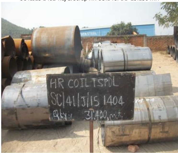
SC41J15 1404-Rej & Scrap HR COIL TSPDL -31.400 M.T

SC41J15 1402-Rej & Scrap HR COIL TSPDL -29.130 M.T