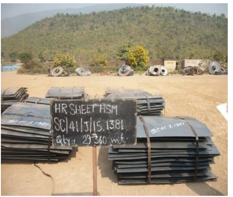
SC41J15 1381-Rej & Scrap HR SHEET HSM -29.360 M.T