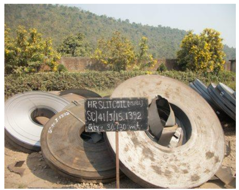
SC41J15 1392-Rej & Scrap HR SLIT COIL TSPDL -30.130 M.T