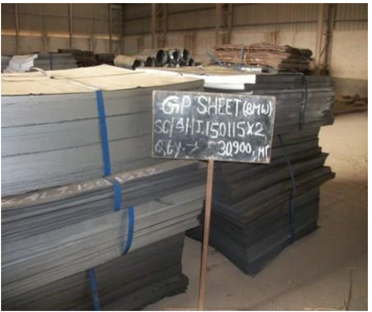
SC41J150115X2-Rej & Scrap GP SHEET BMW -30.900 M.T

SC40J130115X4-Rej & Scrap GP SHEET BMW -31.490 M.T