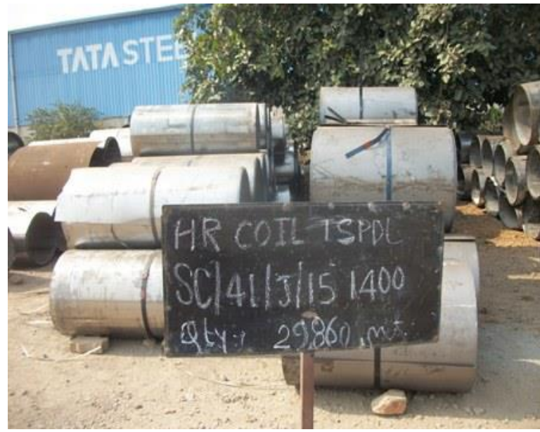
SC41J15 1400-Rej & Scrap HR COIL TSPDL -29.860 M.T