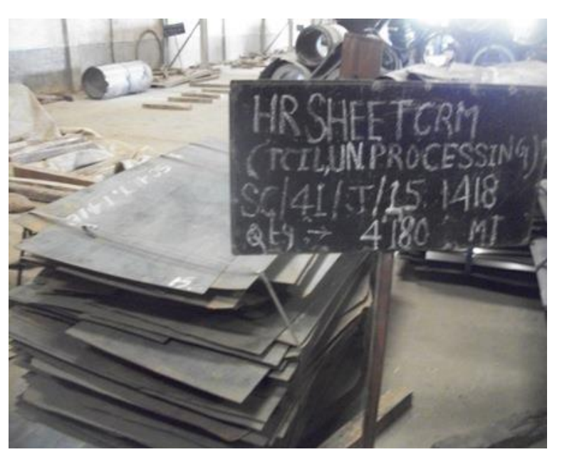
S/41/J/15/1418 -Rej & Scrap HR SHEET CRM(TCIL UN PROCESSING) -4.180 M.T