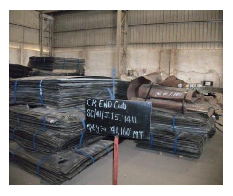
SC41J15 1411-Rej & Scrap CR END CUTS -41.160 M.T