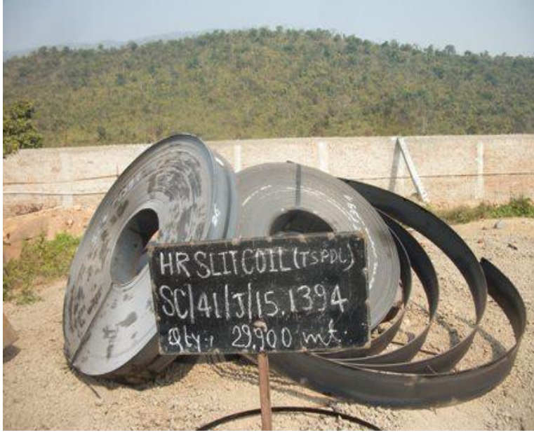
SC41J15 1394-Rej & Scrap HR SLIT COIL TSPDL -29.900 M.T