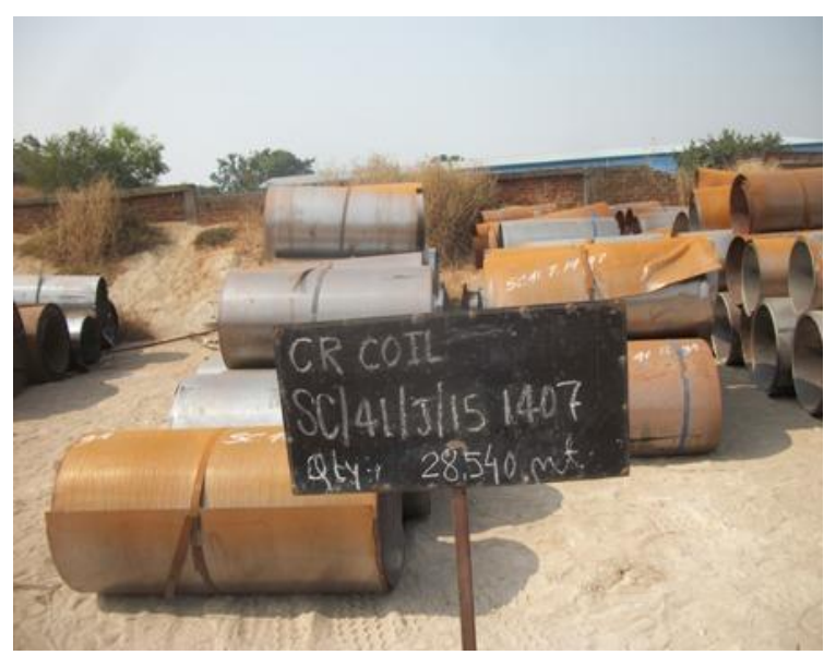
SC41J15 1407-Rej & Scrap CR COIL -28.540 M.T