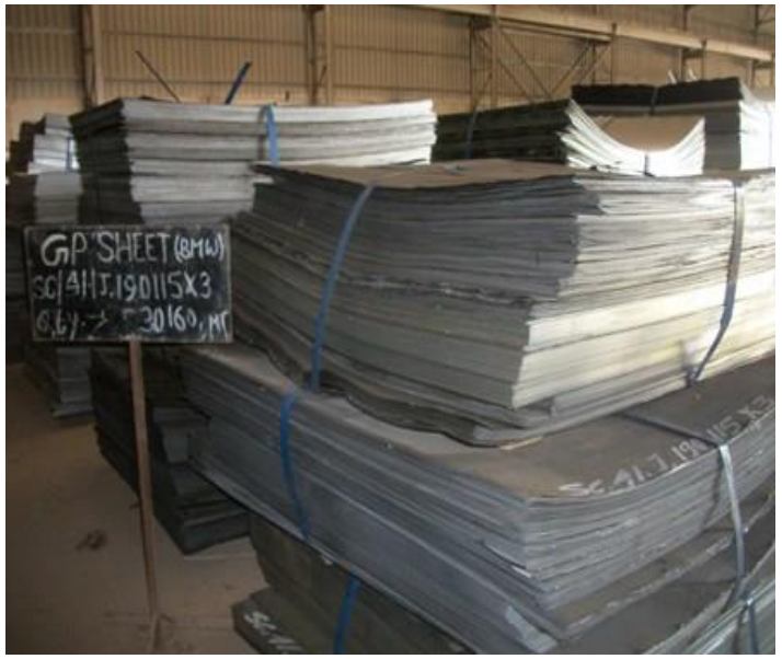
SC41J190115X3-Rej & Scrap GP SHEET BMW -30.160 M.T

SC41J170115X2-Rej & Scrap GP SHEET BMW -30.610 M.T