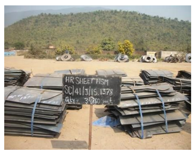
SC41J15 1378-Rej & Scrap HR SHEET HSM -34.860 M.T