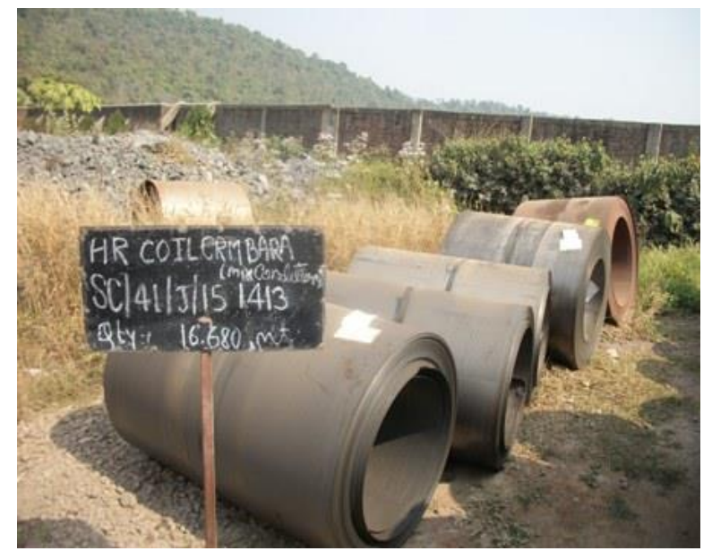
SC41J15 1413-Rej & Scrap HR COIL CRM BARA(IN MIX CONDITION) -16.680 M.T

SC41J15 1406-Rej & Scrap HR COIL TSPDL -28.310 M.T