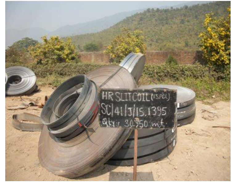
SC41J15 1395-Rej & Scrap HR SLIT COIL TSPDL -30.950 M.T