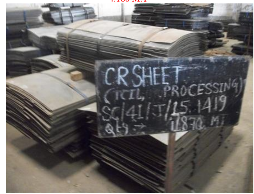
S/41/J/15/1419 -Rej & Scrap CR SHEET (TCIL PROCESSING) -11.870 M.T