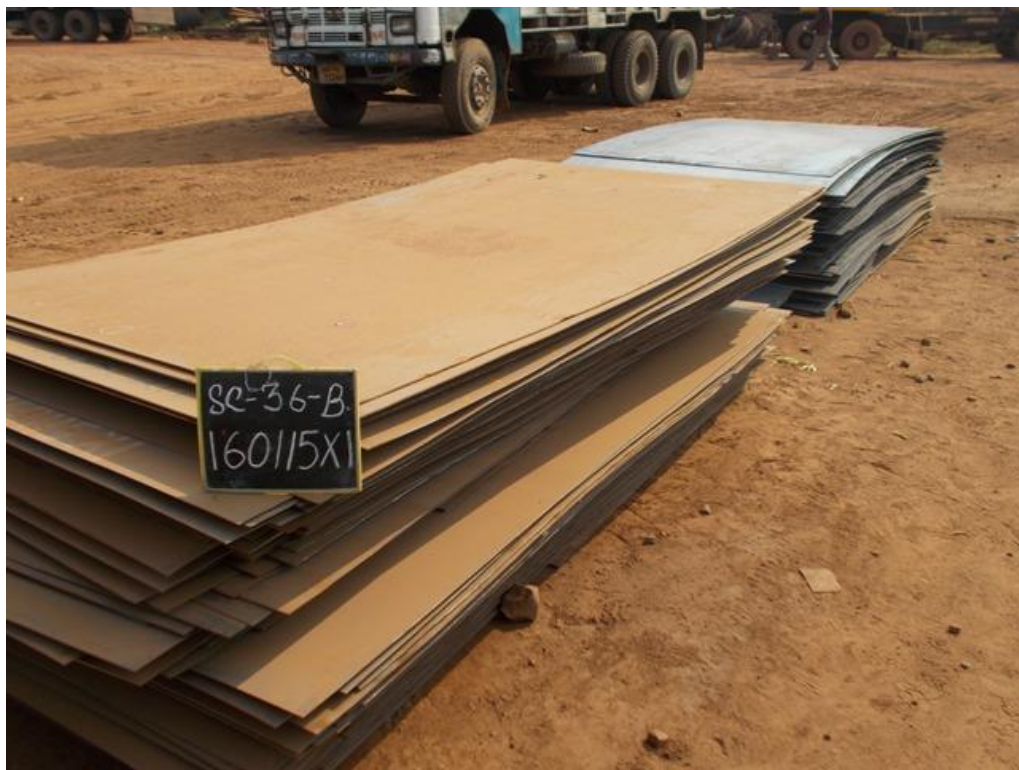
SC/36/B160115X1 – REJ. & SCRAP HR PUP COIL(STRAIGHTENED). – 15.960 M.T.