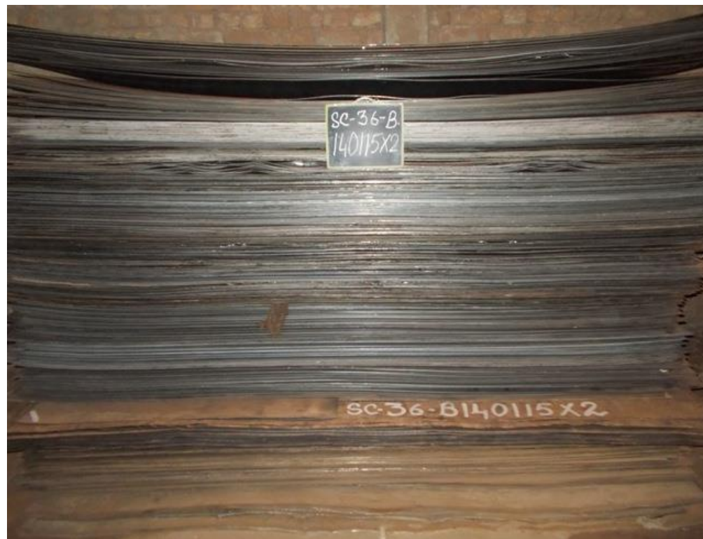
SC/36/B140115X2 – REJ. & SCRAP CR COIL STRAIGHTENED. – 31.390 M.T.