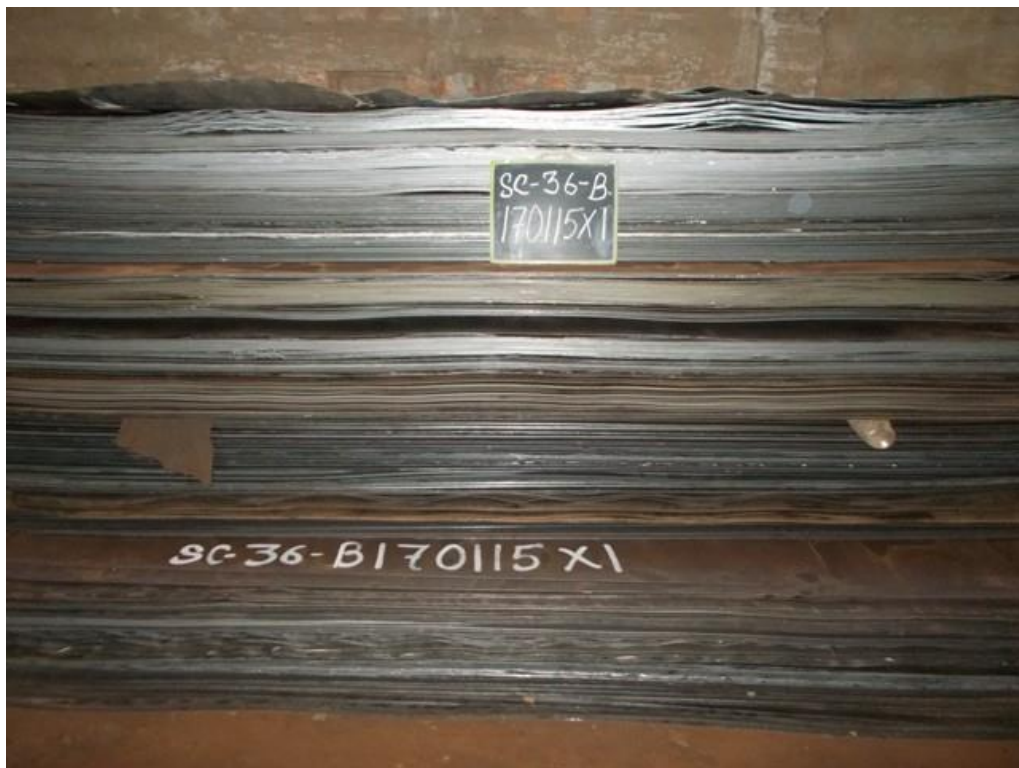
SC/36/B170115X1 – REJ. & SCRAP CR COIL STRAIGHTENED. – 31.590 M.T.