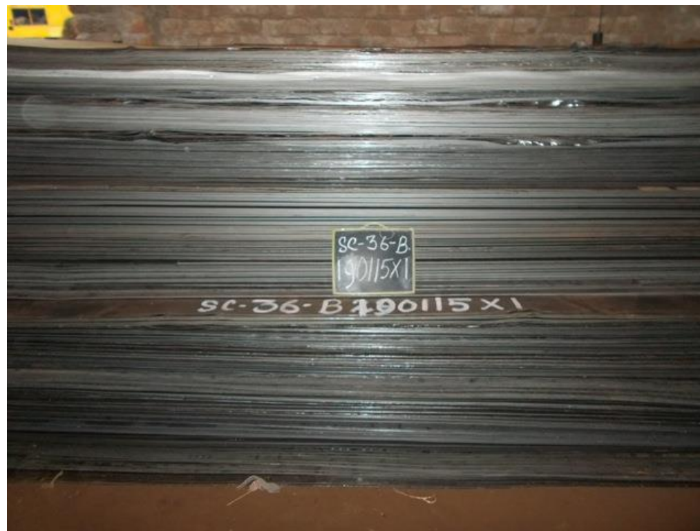
SC/36/B190115X1 – REJ. & SCRAP CR COIL STRAIGHTENED. – 31.720 M.T.