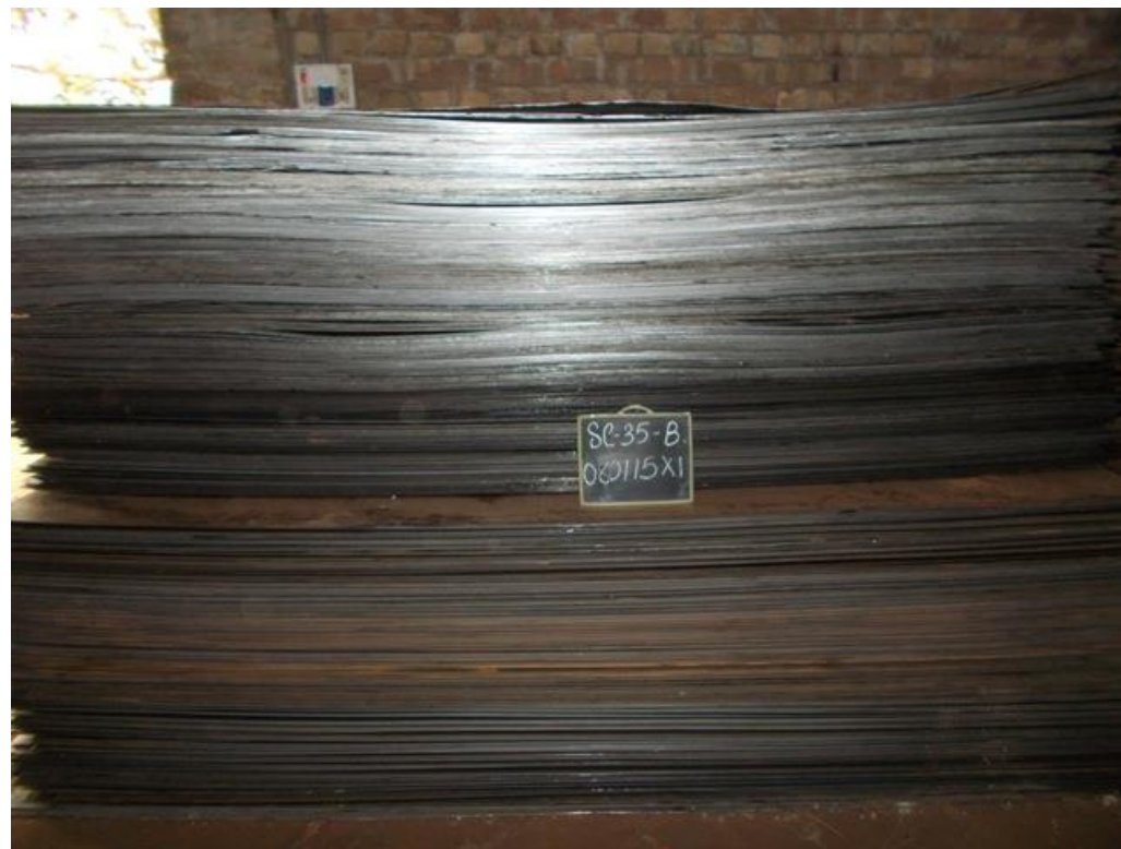
SC/35/B080115X1 – REJ. SCRAP CR COIL STRAIGHTENED. – 31.650 M.T.