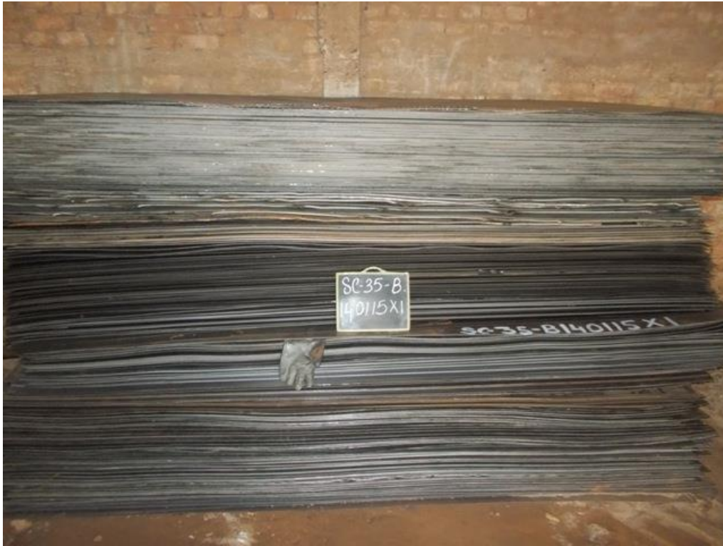
SC/35/B140115X1 – REJ. SCRAP CR COIL STRAIGHTENED. – 31.140 M.T.