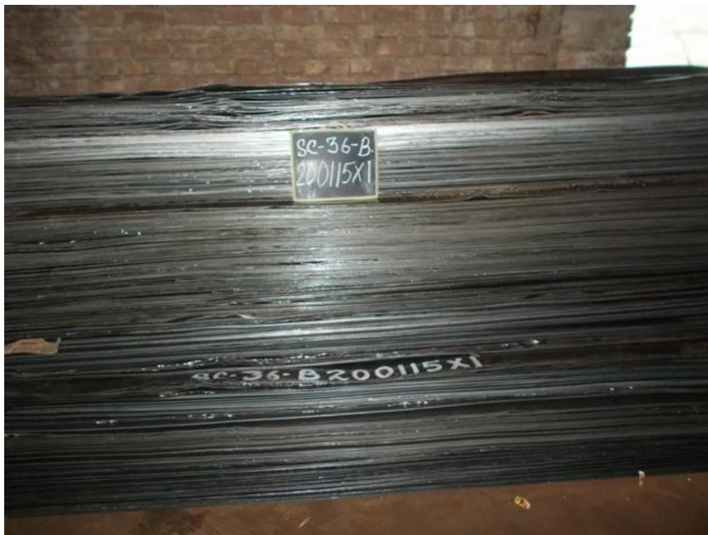
SC/36/B200115X1 – REJ. & SCRAP CR COIL STRAIGHTENED. – 30.840 M.T.