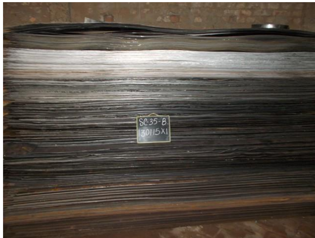
SC/35/B130115X1 – REJ. SCRAP CR COIL STRAIGHTENED. – 31.140 M.T.