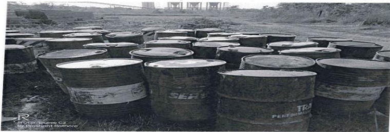
LOCATION-BHEL STORE 5(OUTSIDE AREA)